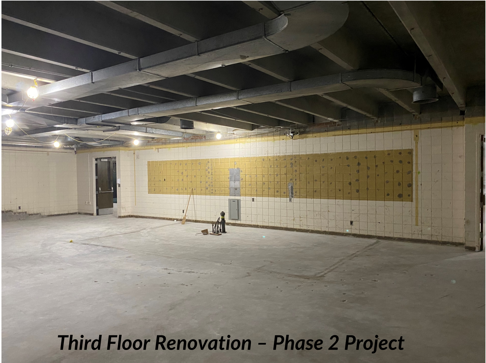
Third Floor Renovation – Phase 2 Project