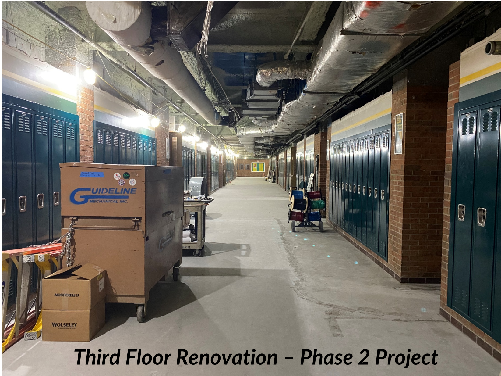
Third Floor Renovation – Phase 2 Project