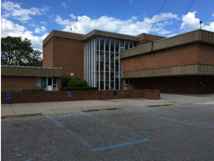
GP North HS