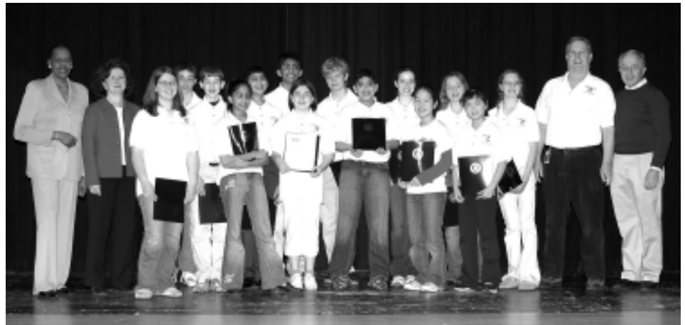
Congresswoman Carolyn Cheeks Kilpatrick presented a challenge to the Parcels MathCounts team and student body -- set the pace.

student, and providing an environment that fosters respect. Together we will create an environment and culture that reflects these guiding principles. The Strategic Plan also sets forth the following seven indicators of success.