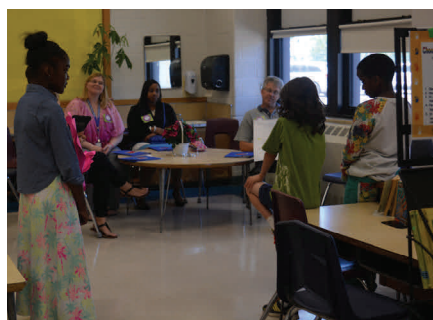
Student Lighthouse Presentations