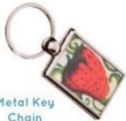
Metal Key Chain